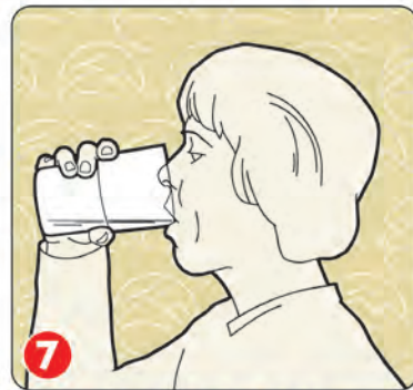
RINSE & SPIT