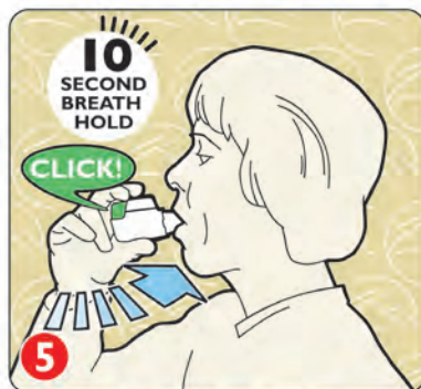
5 STRONG DEEP BREATH IN