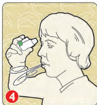
4 BREATHE OUT