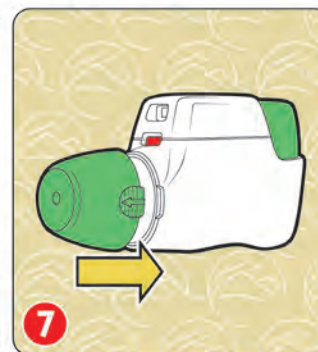
7 REPLACE CAP